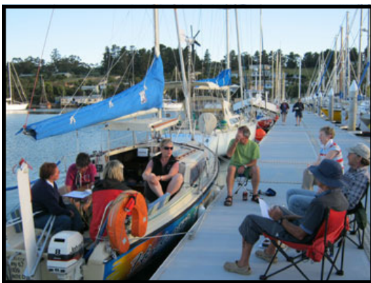
5 o'clock drinks at Kettering

Following launching at Hobart we sail / motored down the Derwent to Tinderbox Bay for lunch, then onto the marina at Kettering, a 20 km sail. Kettering is a very well protected harbour full of yachties with a new marina overlooked by the Pub.