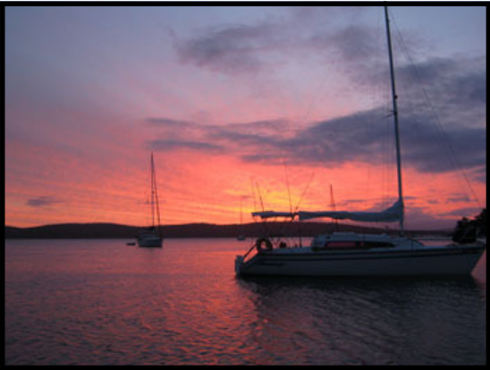
Sunset, Tin Pot Bay ~ Bruny Island