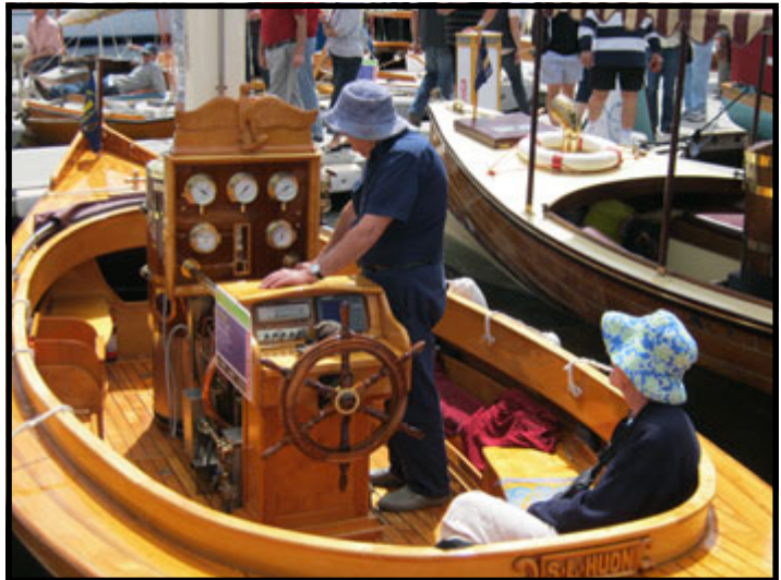
One of the many wooden boats

The bi-annual "Australian Wooden Boat Festival" at Coronation Dock Hobart was in full swing. A fantastic collection of in excess of 500 wooden boats of all descriptions and sizes, beautifully restored and maintained. Yachts, power boats, steam boats, sculls. We could not help but be impressed with the dedication and beauty of these craft and would recommend our readers to go to the next Festival in historic Hobart in 2013.