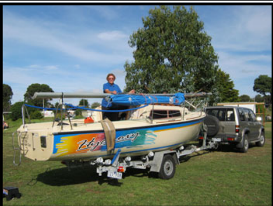
Time to pack up and head for home

A long haul to the south the next day past a number of fish farms we found a great anchorage from the then North Easterly winds. Rubber duck trips to shore for the inevitable BBQ and some more rock oysters coupled with some sizeable flatheads and washed down with some delightful reds made a great evening meal.