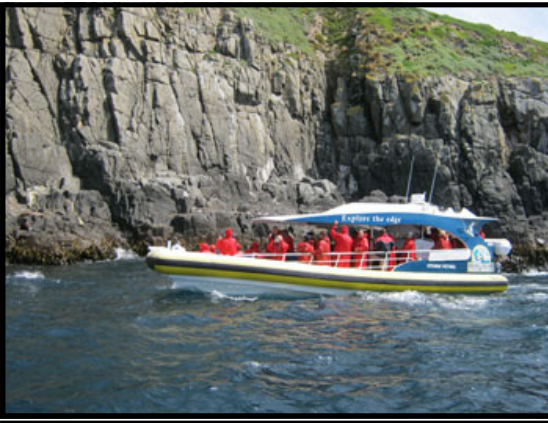
RIB ride ~ South Bruny Island