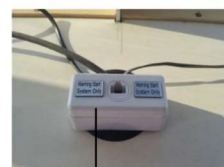
Wall Plate Radio Room