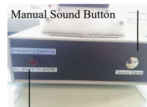
Emergency Light Flasher

Please contact me if you have any questions. Gordon 0430 207 907