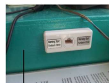
Wall Plate Race Control Room